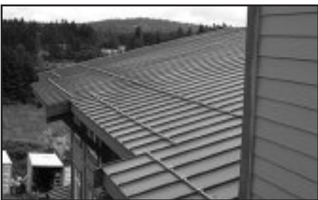
Berger Single Rail System