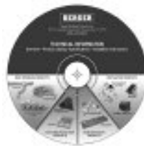
Technical Info CD