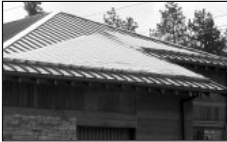
Berger 3-Rail System