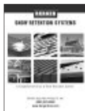
Snow Retention Brochures